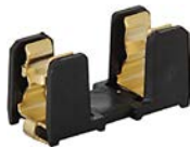
OGN-SMD for increased solder temperature with gold contacts