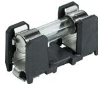
OGN-SMD equipped with var. fuses