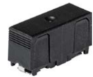
OGN-SMD equipped with var. fuses and cover

500 VAC · 4 W/16 A (VDE) · 500V · 16 A (UL/CSA)