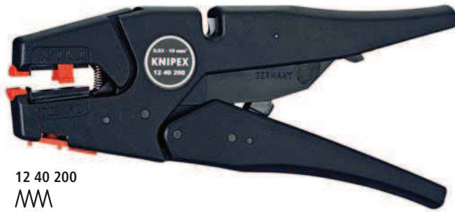
12 40 200 MM