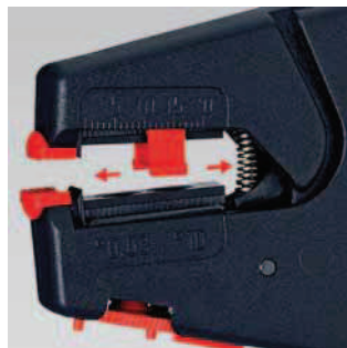
12 40 200: Adjustable length stop