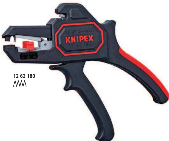
12 62 180 MM