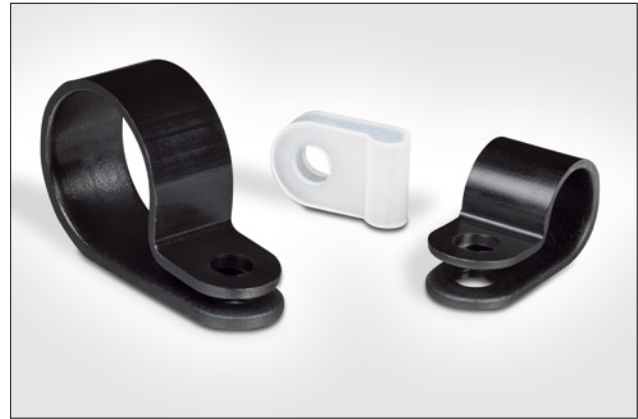
P-Clips H1P - H18P in different dimensions.