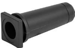
Cable Guard KT14 PVC Cable Guard for rewireable connectors