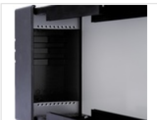
Mounting set for connectors DIN EN 60603-2 (previously DIN 41612), aluminium