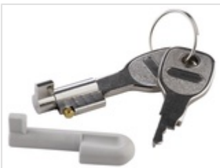
Cylinder catch for CC 500 TK / NGTK