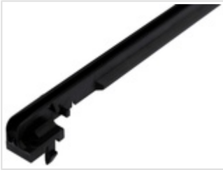
Card guides for 19" internal constructions