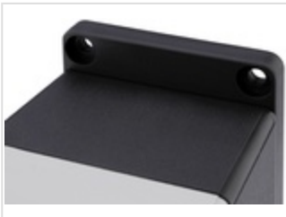
Wall frame for CC 500