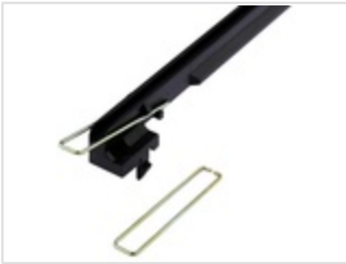
Card retainers for card guides KF 1230