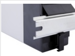
Snap foot for top hat rails DIN EN 60715 TH 35 for insertion into the grooves in the rear lid, polyamide