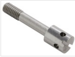
Capstan-headed screws, sealable