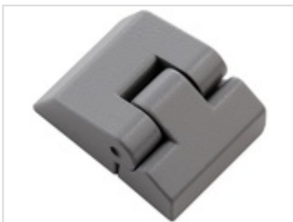
Set of hinges