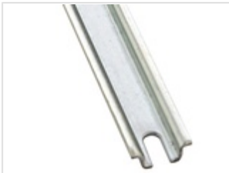
DIN rails DIN EN 60715 TH 15