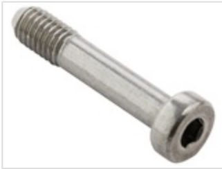
Allen cheese-head screw for lid