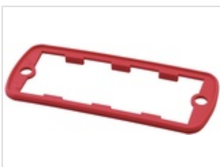
Seals, fire red