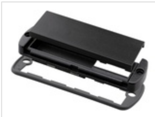
Mounting lid with removable aluminium cap and compartment for 9V block battery