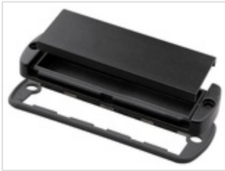
Mounting lid with removable aluminium cap