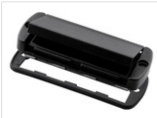
Mounting lid with hinged aluminium flap