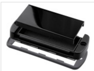
Mounting lid with infrared-permissive plastic cap