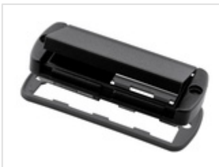
Mounting lid with hinged aluminium flap and compartment for 9V block battery