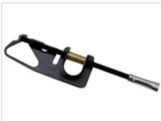
Standard retaining clasp in accordance with DIN 43835 form B (only for use with NGS-ZE)