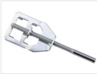
Screw clamp for screw-fitting enclosure