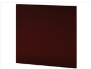
Plastic front panel, red translucent