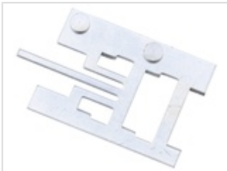
Connecting piece for insertion of standard retaining clasps acc. to DIN 43835