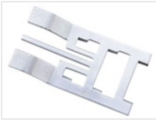
Spring clamp for fixing enclosure