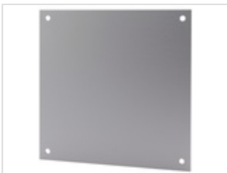
Front panels, natural-coloured anodised aluminium