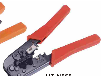
HT-N568 7.3" (185mm) Patented