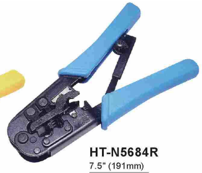
HT-N5684R 7.5" (191mm) Patented