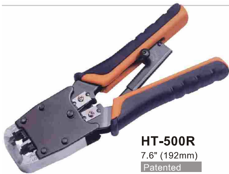
HT-500R 7.6" (192mm) Patented