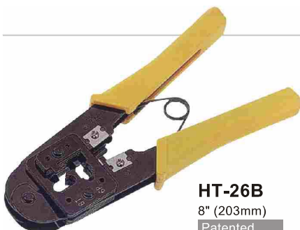
HT-26B 8" (203mm) Patented