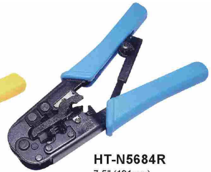
HT-N5684R 7.5" (191mm) Patented