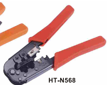
HT-N568 7.3" (185mm) Patented