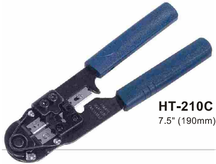
HT-210C 7.5" (190mm)