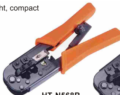
HT-N568R 7.3" (185mm) Patented

Replacement blade: HT-546/546R....HT-200S HT-568/568R....HT-RB08S