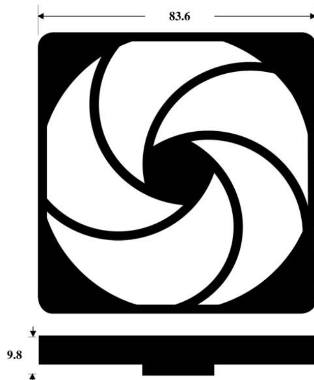
Guard "G" / G80P